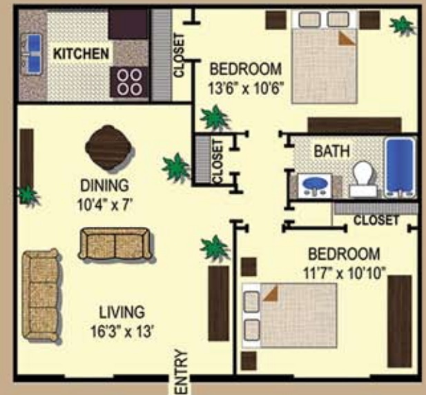
2 Bedroom / 1 Bath 858 Sq. Ft. $ _____