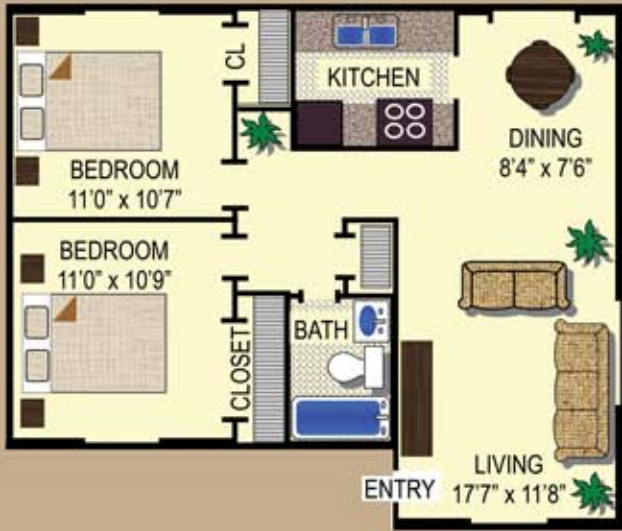
2 Bedroom / 1 Bath 828 Sq. Ft. $ _____