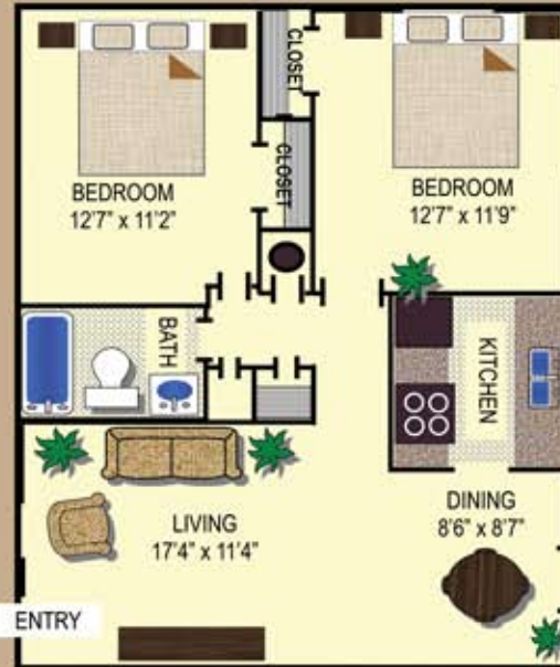
2 Bedroom / 1 Bath 868 Sq. Ft. $ _____