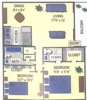
Two Bedroom / One and half Bath STANDARD APARTMENT HOME 900 Square Feet