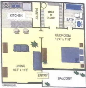
One Bedroom / One Bath STANDARD APARTMENT HOME 600 Square Feet