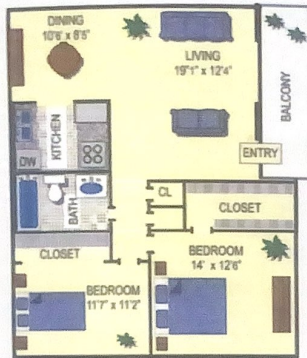
Two Bedroom / One Bath STANDARD APARTMENT HOME 925 Square Feet