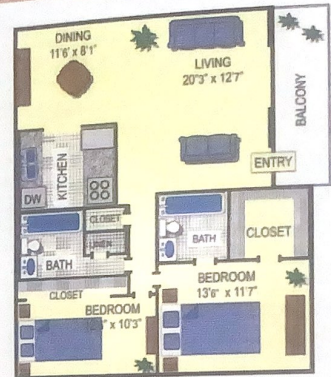
Two Bedroom / Two Bath STANDARD APARTMENT HOME 975 Square Feet