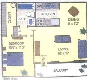
One Bedroom / One Bath STANDARD APARTMENT HOME 730 Square Feet